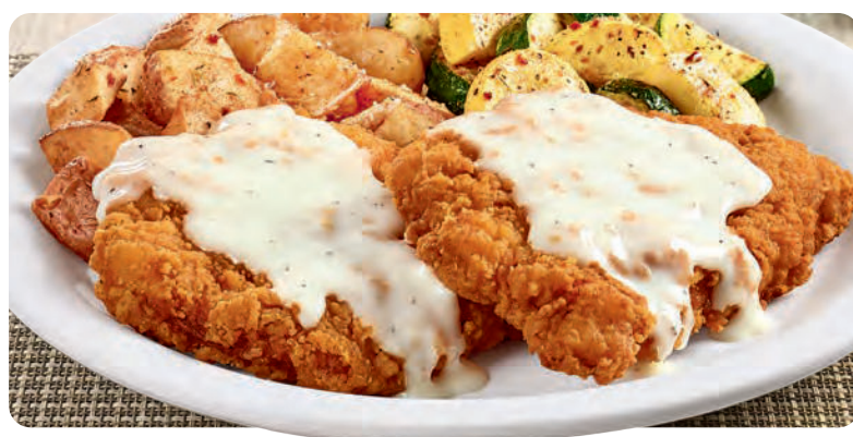
PLATE LICKIN' CHICKEN FRIED CHICKEN

Wild-caught white fish fillets fried golden-brown. Served with tartar sauce, wavy-cut fries plus one additional side and dinner bread. 840-1220 Cals 16.99