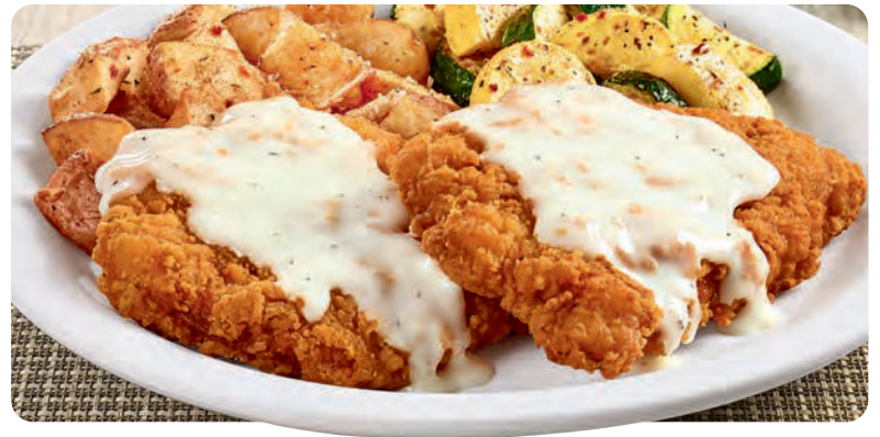
PLATE LICKIN' CHICKEN FRIED CHICKEN

Wild-caught white fish fillets fried golden-brown. Served with tartar sauce, wavy-cut fries plus one additional side and dinner bread. 840-1220 Cals 16.99