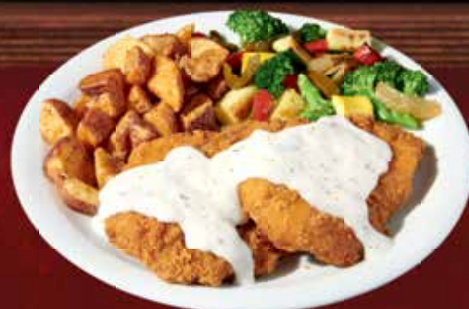
PLATE LICKIN' CHICKEN FRIED CHICKEN

Three wild-caught white fish fillets fried golden-brown. Served with tartar sauce, wavy-cut fries plus one additional side and dinner bread. 1080-1390 Cals 17.99